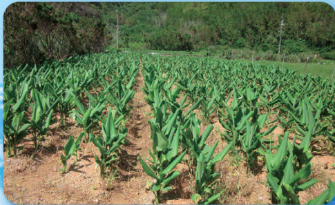
The UKON ingredient in Okinawa KANGEN UKON Σ is grown in the fields of Yanbaru, well known for its mineral-rich soil.

The synergistic effect resulting from combining KANGEN UKON with antioxidative KANGEN WATER® makes it a revolutionary supplement.